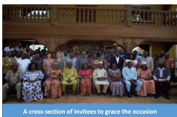
A cross-section of invitees to grace the occasion