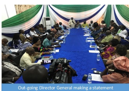
Out-going Director General making a statement