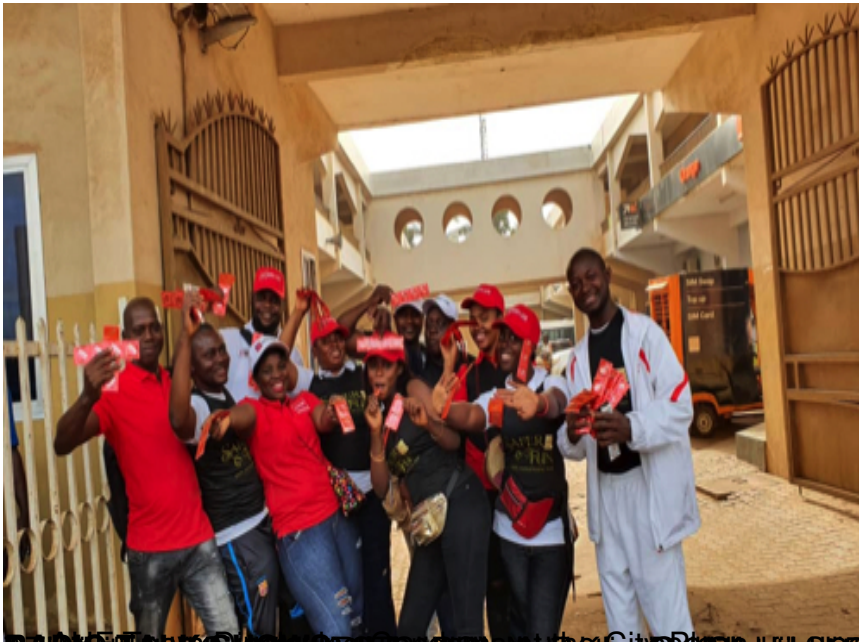
Partners of the National HIV/AIDS Secretariat, AIDS Healthcare Foundation (AHF) and Partners celebrate the launch of the National HIV/AIDS Secretariat, AIDS Healthcare Foundation (AHF) and Partners