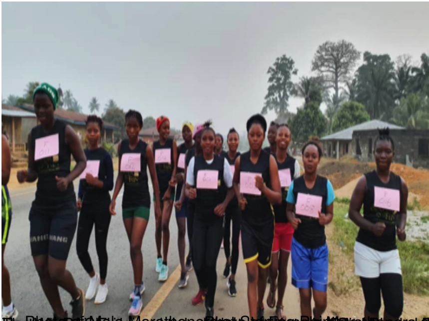
Runners participating in the 2019 National HIV/AIDS Secretariat, AIDS Healthcare Foundation (AHF) and Partners Celebrate 100 Days of the End of the HIV/AIDS Epidemic Race in the Gambia