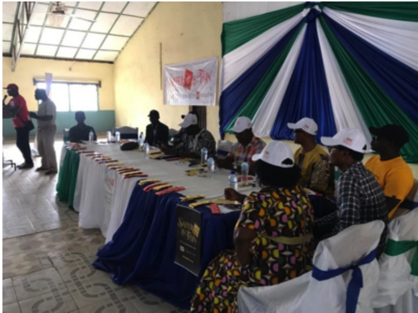
Members of the High Table During ICD 2020

The National HIV/AIDS Secretariat (NAS), AIDS Healthcare Foundation (AHF) Sierra Leone and partners celebrated the 2020 International Condom Day (ICD) in Kenema City on Friday, 14th February, 2020. The celebration was in collaboration with Local Councils, District Health Management Team (DHMT), the National Commission for Persons with Disabilities (NCPD), Civil Society Organizations (CSOs), Implementing Partners, Sierra Leone Red Cross Society (SLRCS), Eastern Polytechnic, Covenant Hope College, Republic of Sierra Leone Armed Forces (RSLAF), Sierra Leone Police (SLP) and Media Houses.